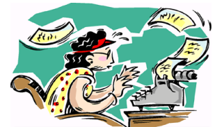
From the Editor

You should then receive a response from the editor who is responsible for that week. If you do not get a response, please call one of us to make sure your article will be included! The DEADLINE for submitting articles is every WEDNESDAY AT 10:00 AM . Articles will be accepted ONLY by e-mail. If you have any questions, please call any one. of us!